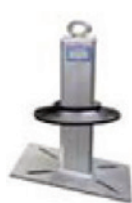
Square base plate 20° inclined