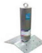
Base plate for roof ridges