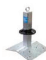
Base plate for roof ridges